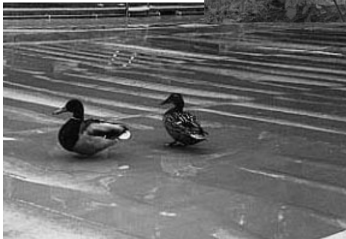
Winter visitors to the Swimming Pool