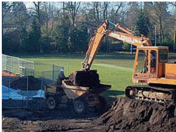
The Mound, making way for the new Music School

We do hope that many Old Boys will return on that day - Sunday July 8th 2001 - to meet up and talk, whatever the weather. For the past two years the cricket match v the Headmaster's XI has been abandoned because of rain!