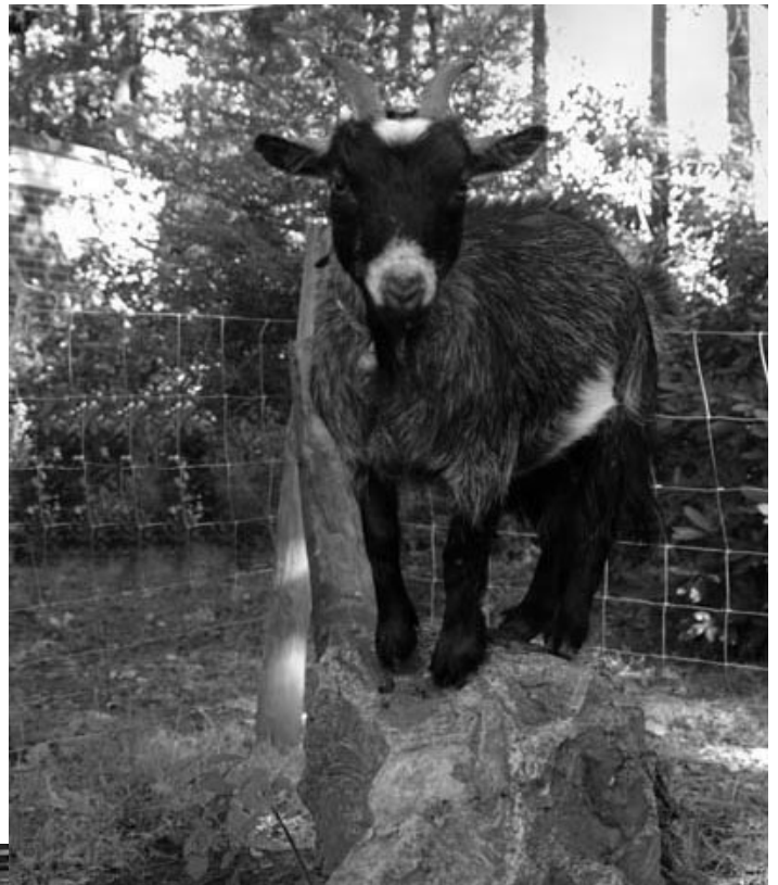
A recent addition to Papplewick