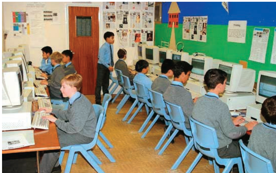
The IT Room