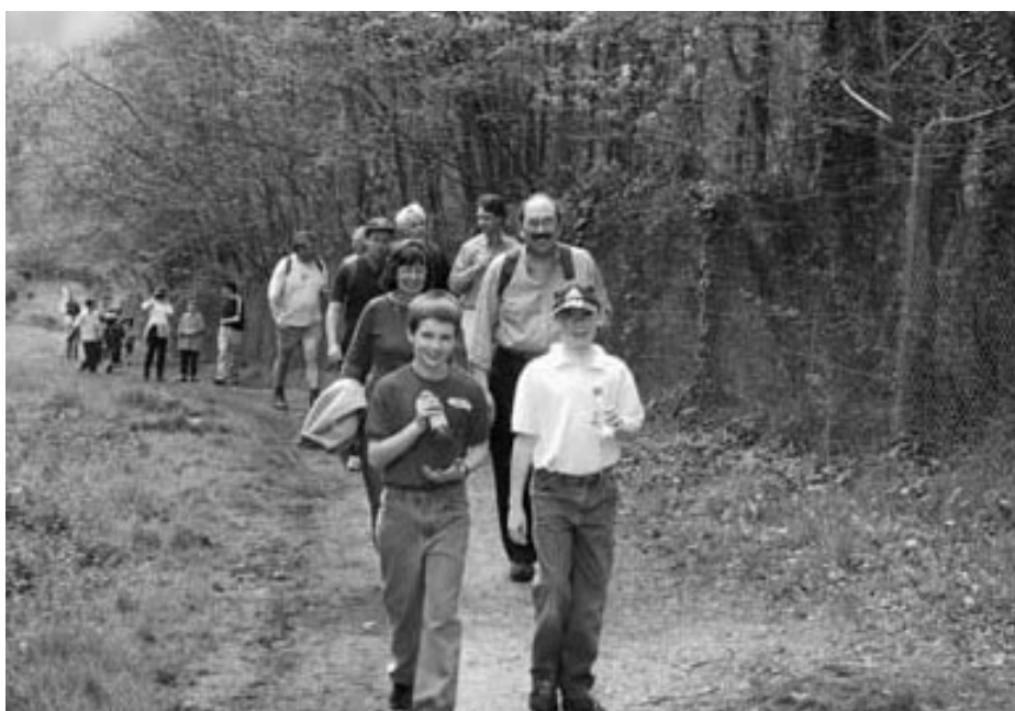
Sponsored Walk at Wellington in 2000