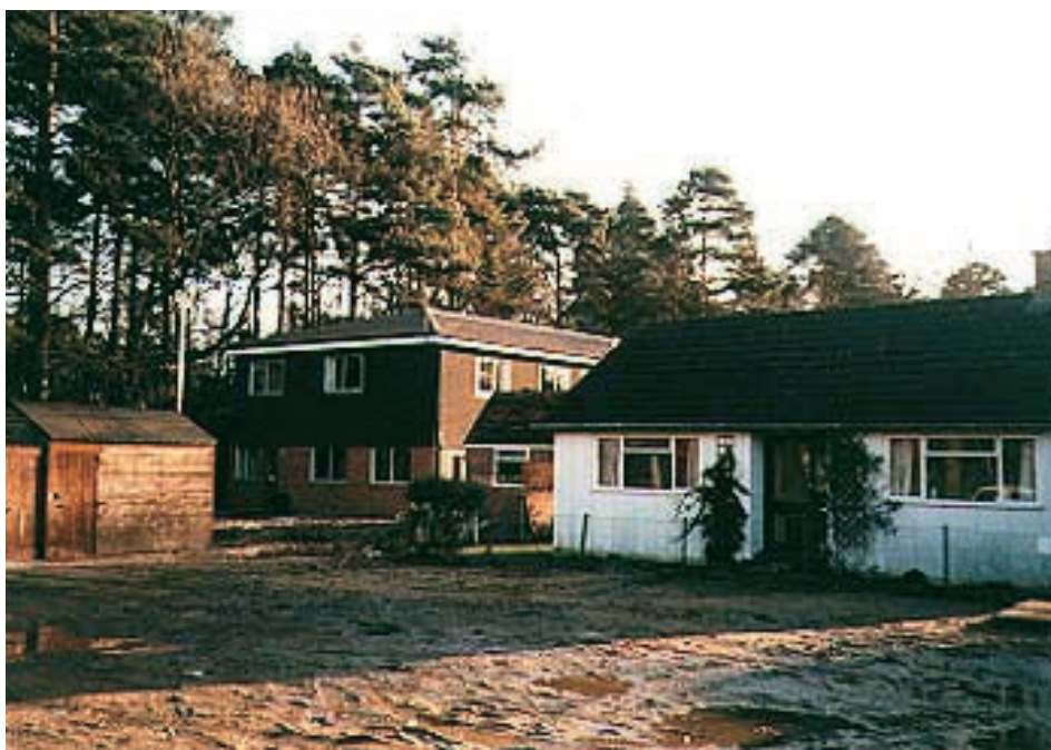
Can anyone name the term and year when this photo was taken?