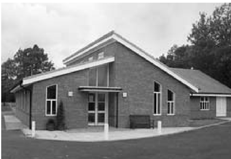
The Music School