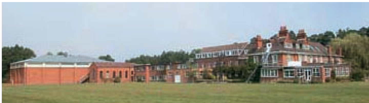
Present view of Papplewick from the South, with the Sports Hall dwarfing the Chapel