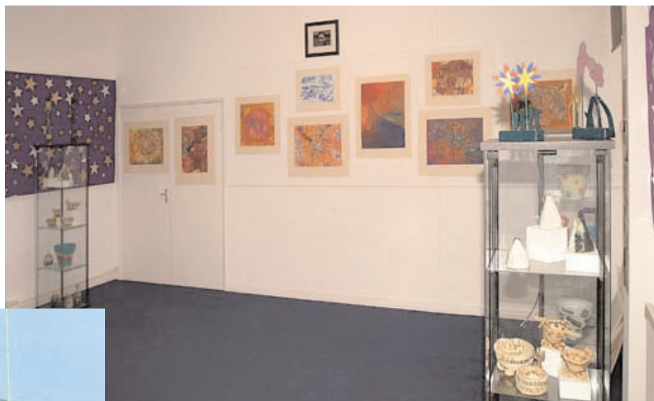
The Azat Gallery