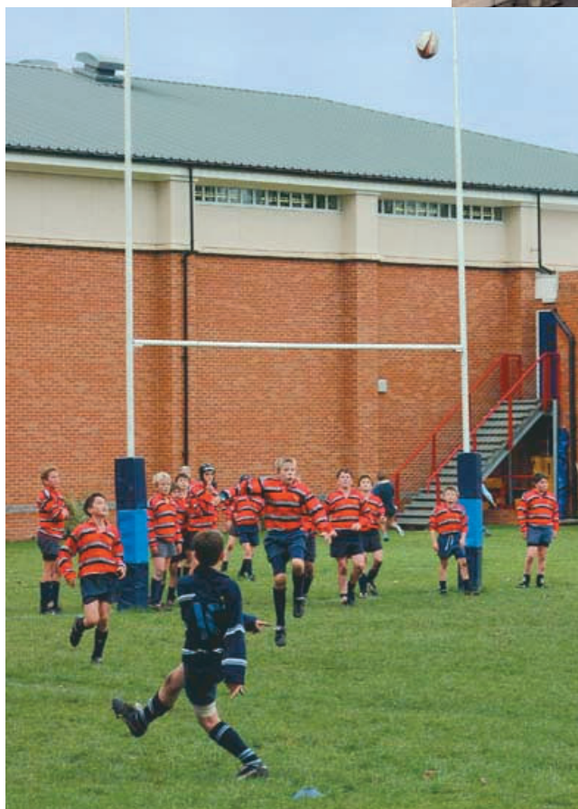
A successful conversion v Hall Grove

Our cricketers enjoyed a mixed season but the Colts, Junior Colts and Under 9s all showed great promise. Lord Cowdrey of Tonbridge opened the Max Liddell-Grainger Sports Hall and then proceeded to watch one of his grandsons hit the winning run for the Under 9s, in their match against Cranleigh. Throughout the winter we shall be preparing for our tour of South Africa in March 2001. Preparations are in