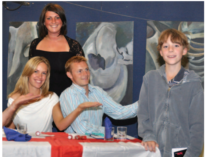
Winner of 'Papplewick's Got Talent'

Tennis – The season was a most enjoyable one with plenty of matches. The highlight was the away fixture against Caldicott, where the match went to the final game of the final rubber, with Papplewick just coming home after a series of deuce points. The School also took part in two tournaments, at Radley and at Hall Grove, where we did creditably in the former and came fourth in the latter.