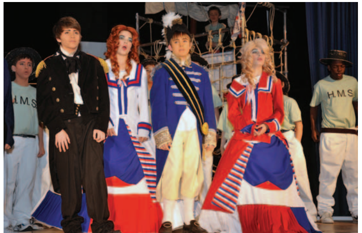
HMS Pinafore 2008

The Dream Factory was the play the Middle School put on, with two evening performances for the first time, to