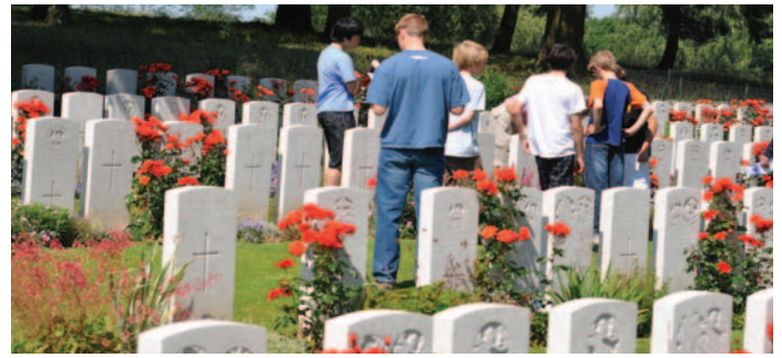
Year 8 visited the War Graves once again