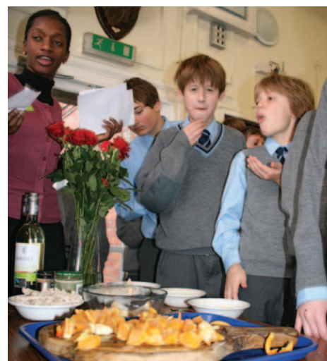
Healthy Eating on Eco Day

Comic Relief Day was celebrated in March last year – the first such day in the history of the School. It was a fun day whose theme was ‘the wrong trousers’, with the Headmaster judging who was wearing the best wrong trousers during the day and awarding prizes to the winners in the Upper and Middle Schools. Special events were also put on by the Staff and the boys, and the boys voted for the best by using £1 tokens. At the end of the day £600 had been raised for charity.