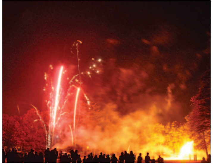
Bonfire Night 2009