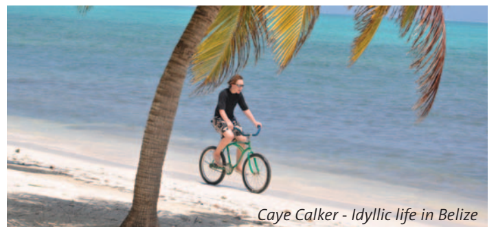
Caye Calker - Idyllic life in Belize

The rest of the stay in Belize was largely social, but it included an exhilarating trip in a superfast boat, a bone jarring, drenching experience in a water taxi and plenty of snorkelling, kayaking, canoeing and paddleboats in glorious sunshine – as well as swimming with nurse sharks and rays. What a holiday!