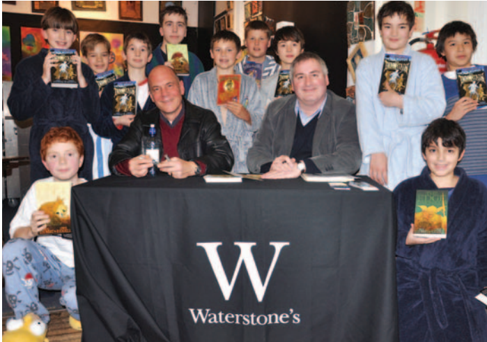
Author Visit by Paul Stewart and Chris Riddell – writers of The Edge Chronicles

which the cast responded really well. It concerned a boy called Arthur, Bad Dreams, Good Dreams and the Land of Nod. Arthur – a typical prep school boy - keeps hearing strange noises coming from under his bed, and when he decides to investigate one evening, he gets more than he bargains for. He is mysteriously transported to a strange bad-dream-like world, where he meets with all sorts of adventures with mysterious people. He manages to escape this dreadful world with the help of some 'goodies', and is only too glad to return to reality – and the Latin test that awaits him. The play proved great fun with the actors learning their lines very well and throwing themselves wholeheartedly into the action.