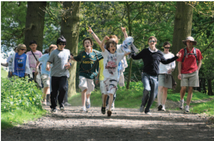
The Sponsored Walk on a sunny day

A visit to a circus meant further instruction, this time in baton balancing, trapeze, tightrope walking, diabolos and ball tricks. Great fun. Archery practice meant popping balloons and a visit to a local castle elicited an interesting talk on the history of the castle itself and its inhabitants. A ‘boules’ tournament meant learning about this very French sport, which was great fun too. Buying food in the street market gave practice for French conversation, and a three-hour walk in a forest was good exercise. The week was a great mixture of language work, French culture and French games.