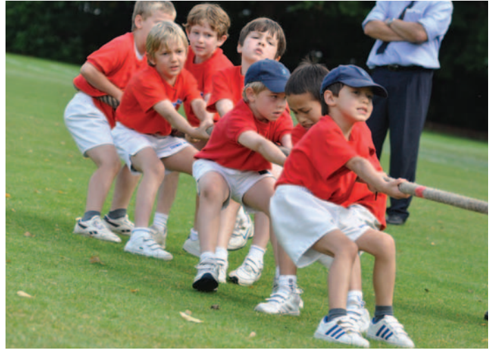
St George's Juniors on Sports Day

This was the strongest team that Papplewick has produced since we started playing nine years ago and we were blessed with having strength in numbers, which meant we were able to field three teams at all the tournaments in which we took part. We had a wonderful season.