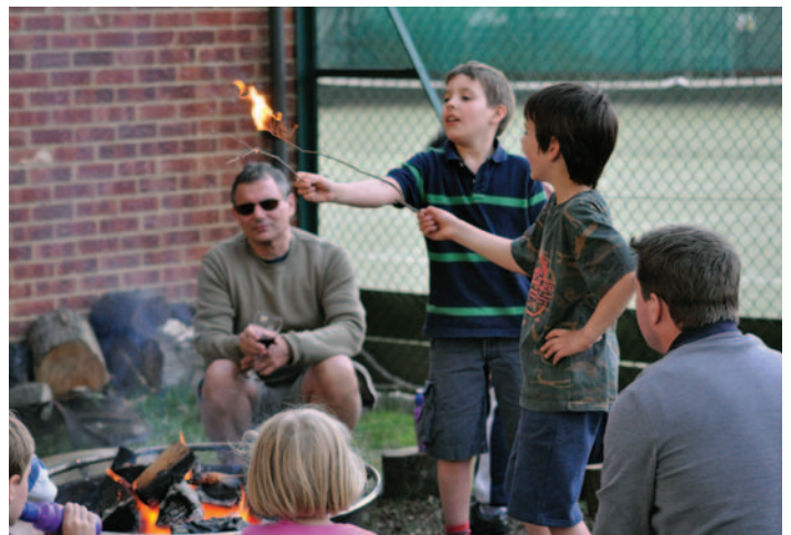
Year 4 Fathers and Sons Camp Out