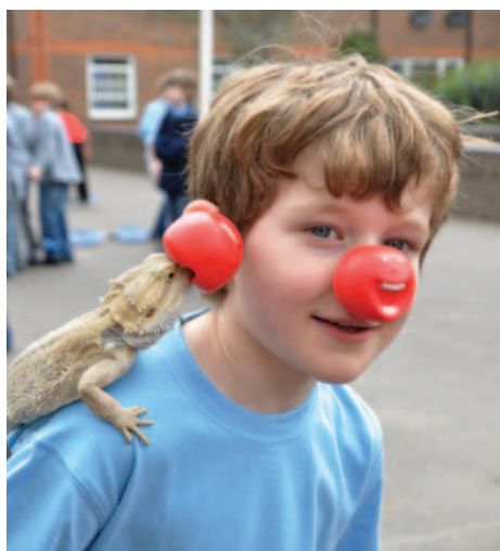
Red Nose Day

In our last edition we mentioned a link which Papplewick had formed with the Bethany Orphanage in Uganda. This enabled the School to link boys in one form of Year 5 with boys of the same age in the orphanage in Kampala, and letters were exchanged once a term. We heard that the other boys in the orphanage would like to receive a letter too, and so now all the boys in year 5 are corresponding with their counterparts in Uganda. Papplewick contributes a small amount of money each term to the orphanage and this has funded the care and education of ten of the children.