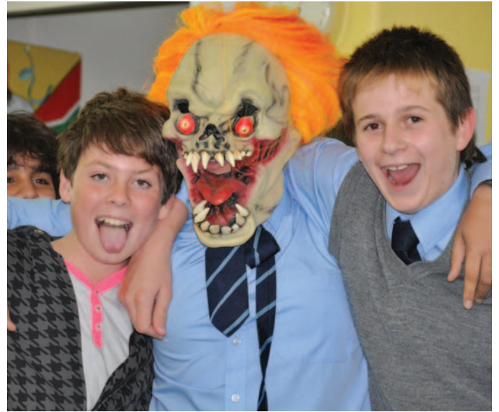
Boys enjoying the Halloween Party

A 'valete' to them appears elsewhere on this page of the newsletter.