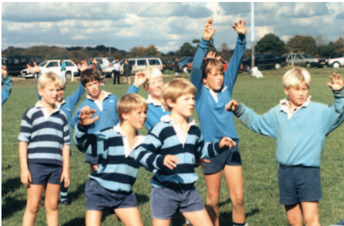
Anyone recognise what year this was?