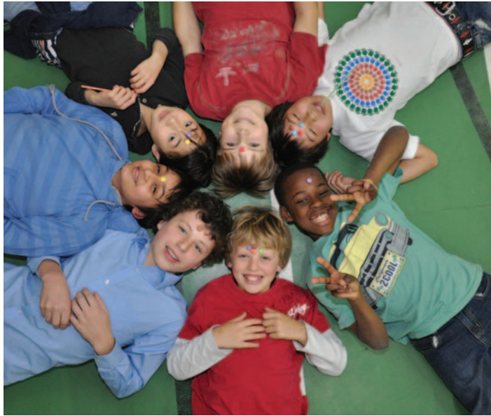
Chocolate Olympics in the Sports Hall

The Headmaster warmly thanked those members of