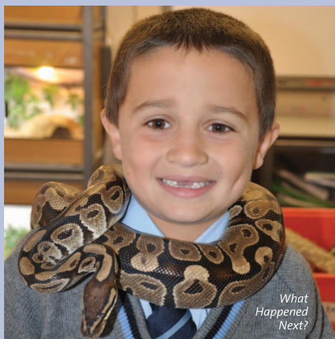
What Happened Next?

The croaking of the tree frogs and the bull frogs and the barking of the painted toads are a joy to listen to during the day. There is plenty in this club which provides both interest and instruction, and the boys love it.