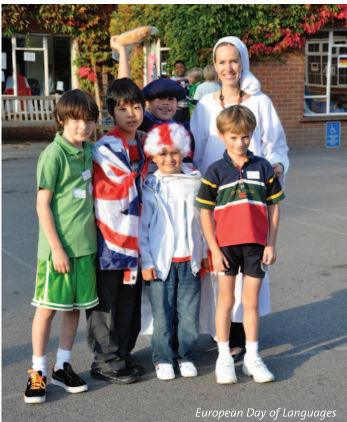
European Day of Languages