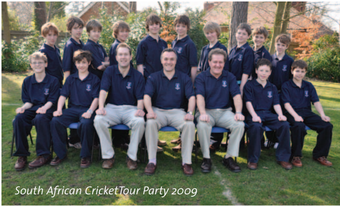
South African Cricket Tour Party 2009

1st XI – When your season includes a win against Summer Fields and draws against Caldicott and The Dragon you can be rightly pleased. It looked as though the team was recovering from its demolition by all eight schools played during the South African tour. But sadly the victory against Summer Fields was the only one the School achieved. 8 games were drawn and 7 lost. Boys produced some individual good performances and the squad certainly improved considerably during the course of the season. And with half of them returning next year we can look forward to a rewarding and exciting 2010 season.