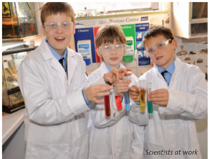
Scientists at work