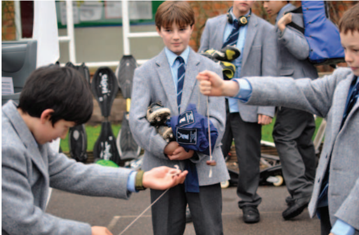
New Dress Regulations for Conkers!

Reward for the hard work that had been put into the exams came in the shape of this great trip, that certainly lived up to expectation. It was good to experience 29 degree heat for one thing and this lasted during the entire visit. The party travelled the canals in vaporettos visiting churches, St Mark's Square and various cobbled streets, marvelling at the architecture and the general tranquillity of the city. Markets were visited, pizzas were eaten, swimming was indulged in and culture was imbibed at every turn.