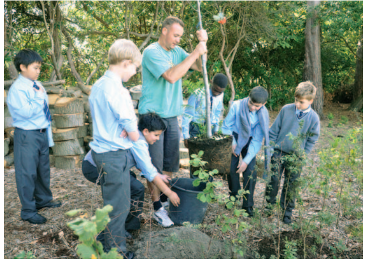
Papplewick Gardeners at work

The Papplewick garden is growing apace, with this year's additions being artichokes, cabbages, sweet corn, herbs, salads, raspberries and rhubarb. Years 3 and 4 join forces as do years 5 and 6 where they help with the digging of beds and the planting, composting, raking and weeding. The Summer term Thursday Activity group maintains it and cuts the surrounding grass. Raised beds were built and installed for the salad plants and vegetables and a new pathway was added to enable easy access. The Eco