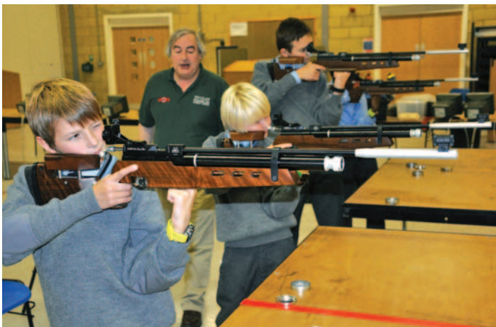
Shooting continues to be a popular activity