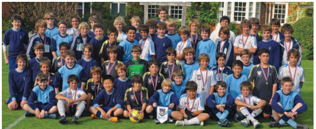
The Argentinian Footballers take on Papplewick

1st XI - The season was marred largely by the snow which fell shortly after term started and interrupted many of the early matches. As a result we didn't get started on the right footing. The team was essentially a strong one with solid players in all areas of the pitch. One fixture was a Summer one against a team from Buenos Aires which had crossed the Atlantic to take part in a tournament in northern France and which extended its tour to include Papplewick. It was an exciting game which the home side won 2-0.